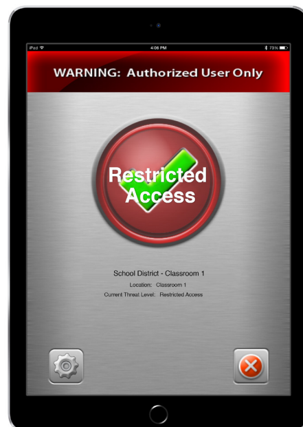
Authorized security personnel and general staff can restrict access to specified locations within their facility.