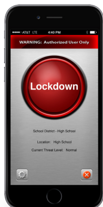
A facility-wide lockdown and emergency response protocols can be initiated with the tap of a button.